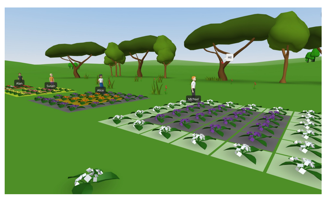
An image from the "Little Gardeners" activity, featuring 4 gardens in a growing pattern created in CoSpaces.